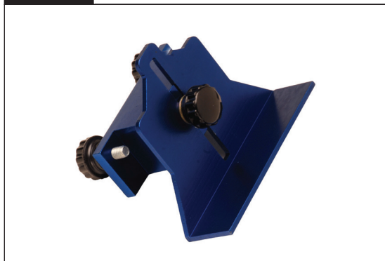
Door Installation Tool