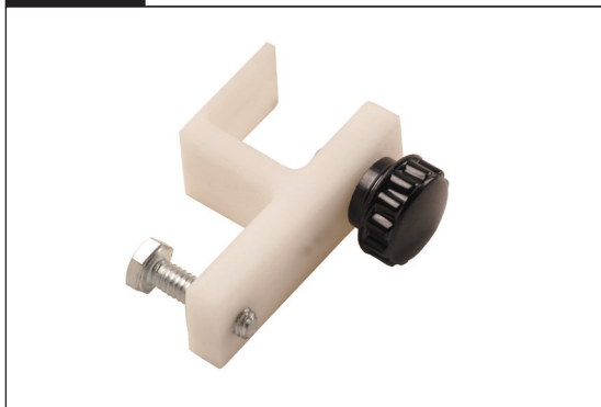
Drawer Front Installation Tool