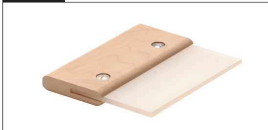
Veneer Smoothing Tool